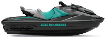
Eclipse Black and Reef Blue