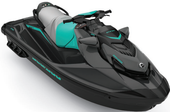
Eclipse Black / Reef Blue