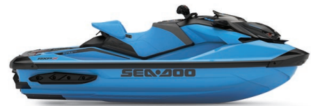
● NEW Gulfstream Blue Premium