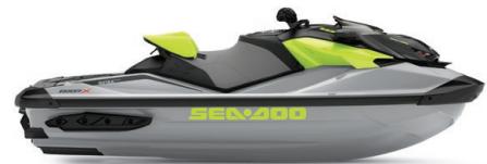
● Ice Metal and Manta Green