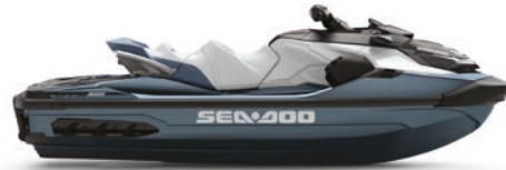
● Blue Abyss